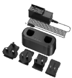
HM-5202ZC2 G Series Charging Base