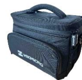
HM-SP01-POUCH M/G/SP Series Pouch